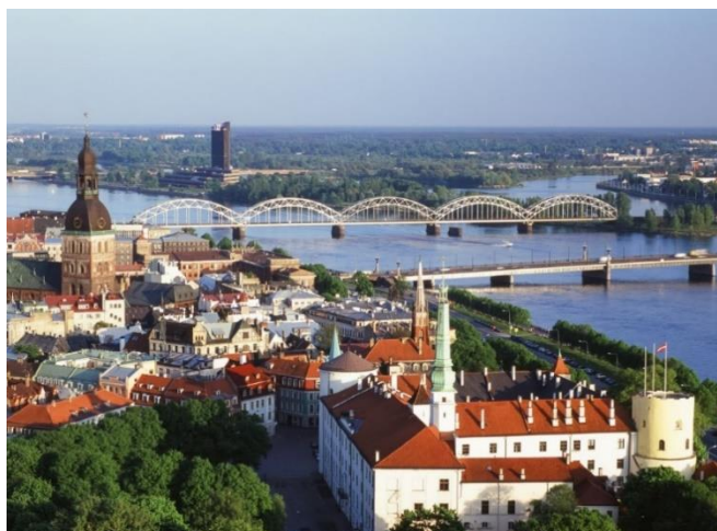
Many of the concerts take place in Latvia’s stunning capital

The Festival takes place over four weekends throughout the summer, bringing the world’s top Orchestras and classical music stars to perform in venues in Riga and Jurmala. Each weekend features one of the world’s best Orchestras alongside star soloists to perform varied and beautiful programmes of classical music over 20 concerts.