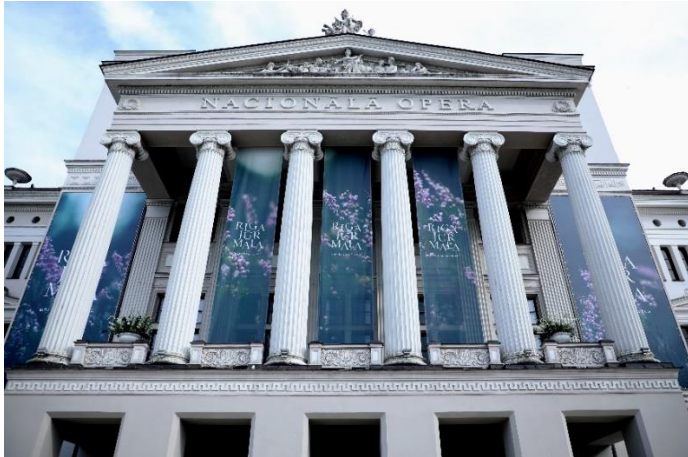
The Latvian National Opera House is one of the many stunning venues for the concerts

This year's programme includes Grammy-Award-Winning vocal group, The King's Singers, who are set to perform a concert based on their upcoming album Finding Harmony . There will also be concerts from the Philharmonia Orchestra, who recorded the film soundtracks for Oliver Twist and Great Expectations .