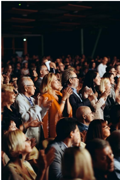
Audience members came from over 50 different countries last year