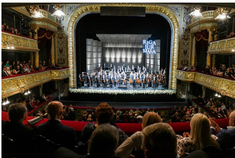
The Bavarian Radio Symphony Orchestra return to the Festival in 2020

The Festival had its first ever occurrence last year, and audiences came from over 50 countries to experience the unique atmosphere, with most of the concerts completely selling out.