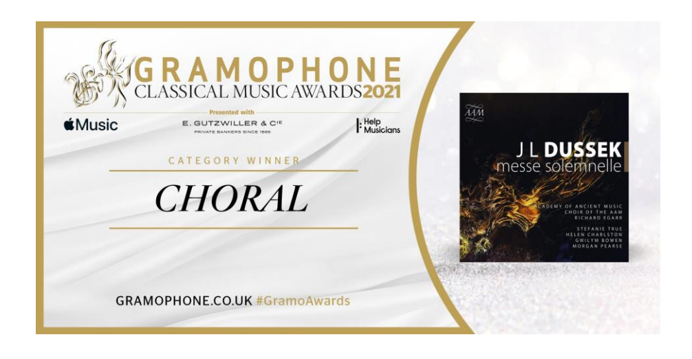
Dussek: Messe solemnelle

The Takács Quartet and pianist Garrick Ohlsson, this year's winners of the Chamber category, present two complementary piano quintets by Amy Beach and Edward Elgar. Written during a fruitful period at Brinkwells in 1918, Elgar's Piano Quintet inhabits the same emotional landscape as its contemporary, the Cello Concerto. Beach's commanding offering, written on the other side of the Atlantic in 1907, marked the ambitious dawn of a new century. In its review, Gramophone described the artists' approach to the genre as 'one of an epic nature, almost orchestral in its bold sound and texture', with 'vivid colours and vital energy'.